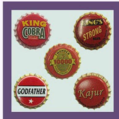
Beer Bottle Caps