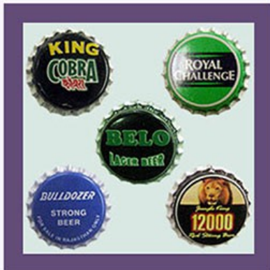
Soft Drink Bottle Caps