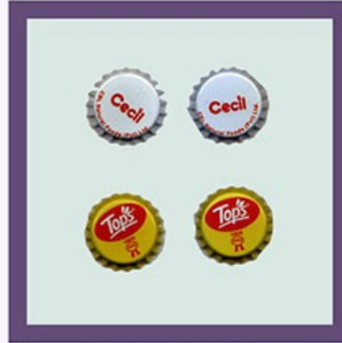
Tomato Ketchup Crown Caps