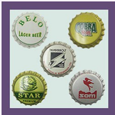
Metal Crown Corks