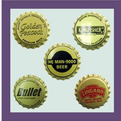
Double Ring Crown Corks