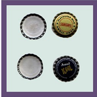
Puff Lined Crown Caps